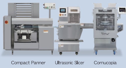
Compact Panner Ultrasonic Slicer Cornucopia