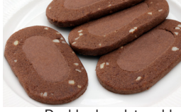
Double chocolate sable