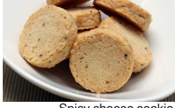
Spicy cheese cookie